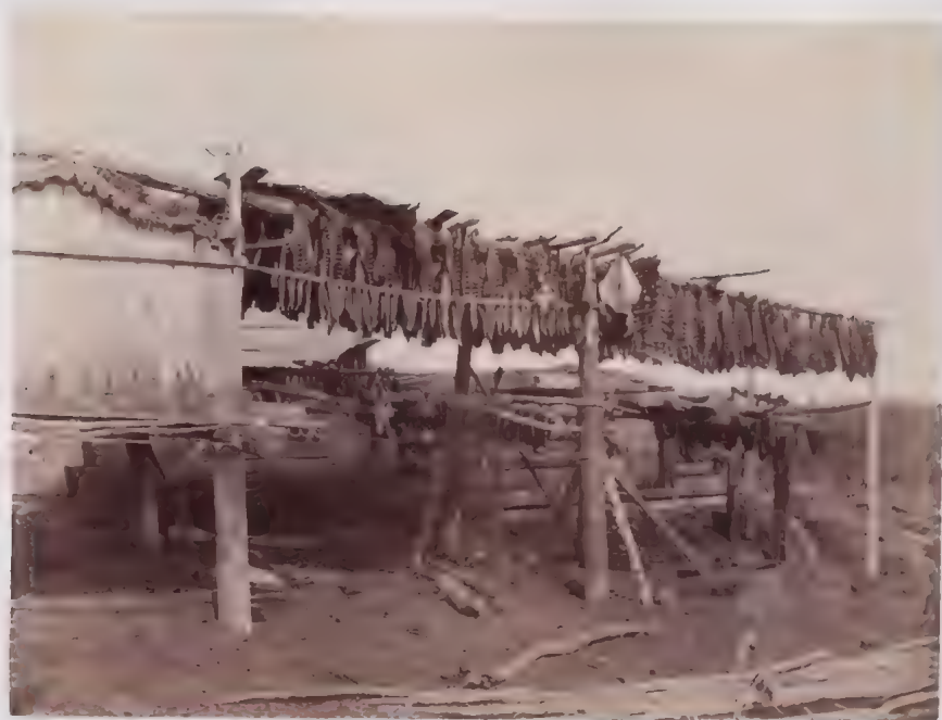
20. Frames for drying fish.